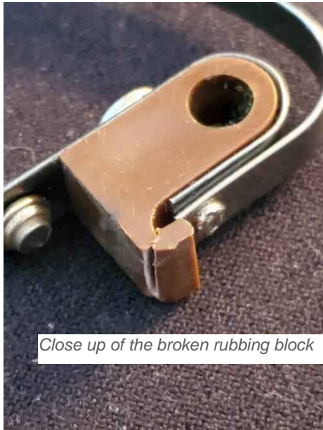
Close up of the broken rubbing block

I had some trouble with the Healey on the way to and from the meeting in September. It was driving fine, but then seemed to be losing power. As I'd come to a stop light, it felt like it just wasn't running on all 6 cylinders, and didn't idle smoothly. The problem was intermittent at first, but was getting worse, so before long I pulled off to see what was