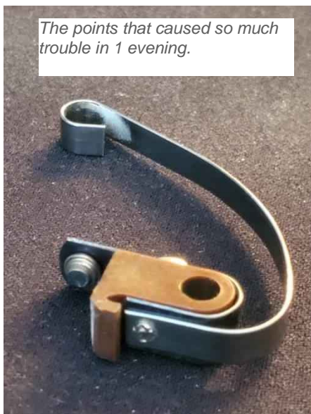
The points that caused so much trouble in 1 evening.